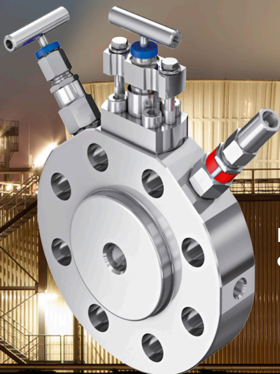
Needle Valves, Monoflanges etc. with OS&Y Bolted Bonnet