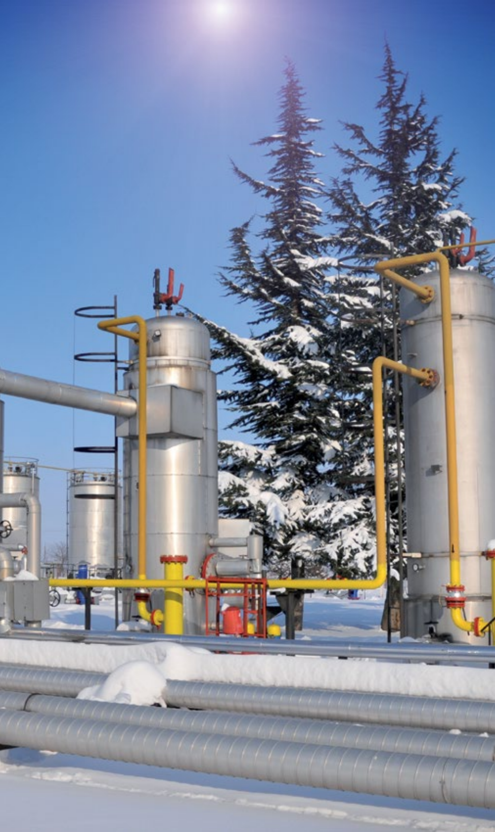
ABB ADCO ADGAS ADWEA Air Liquide Al Hosn Gas AlexFert Alfa Laval Alstom Ashcroft Bapetco BASF Baumer Bayer Borealis Borouge BP Caterpillar

Chevron China Enersave CNNC Conoco Philipps CPC CTCI Corporation Daelim Danfoss DEWA DOW Chemical Emerson (Rosemount) Endress + Hauser E.ON ESNAAD Evonik ExxonMobil Fujian Ningde Nuclear Power Company GASCO