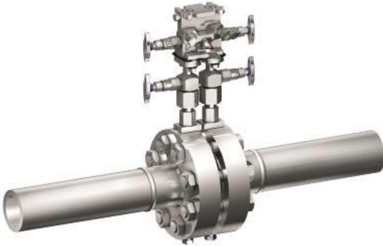
Picture 2: Schneider DirectMount Systems - Enemy of Gauge Line Errors.