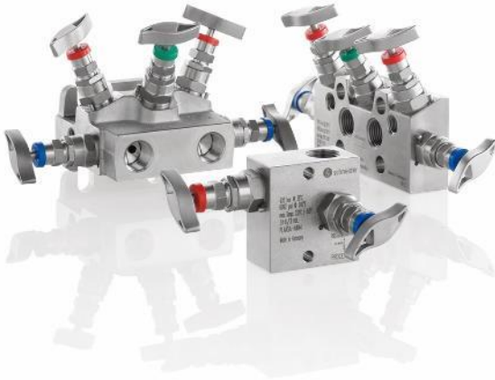
Image 1: At ACHEMA Pulse 2021, AS-Schneider will show a product portfolio that already meets the requirements of the new TA-Luft.