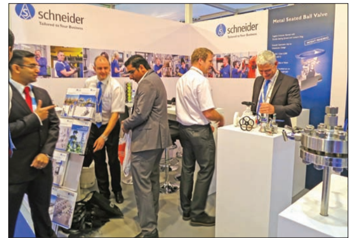
AS-Schneider at Adipec

Since 2011, the company has been focusing on expanding internationally. The firm has set up subsidiaries in Singapore, Dubai (UAE) and Houston (US)