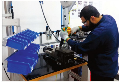
Assembly and testing of needle valves, ball valves and manifolds on-site